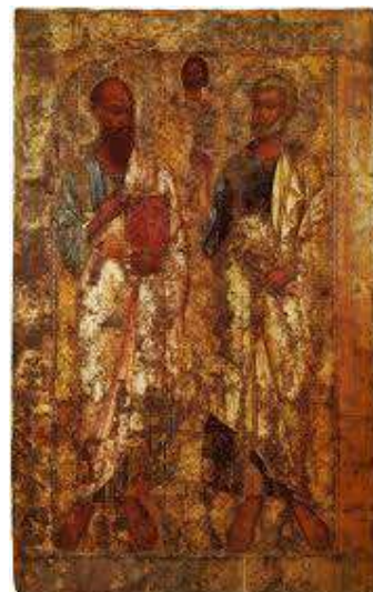
SS Peter & Paul.

The Extraordinary Form of the Mass of the Roman Rite, the "Tridentine" (Latin) Mass, will be offered again at St Stephen Church on Sunday, August 27th ( Twelfth Sunday after Pentecost ), at 12:30 pm.