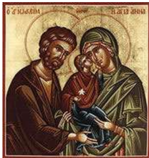
SS Joachim & Ann.